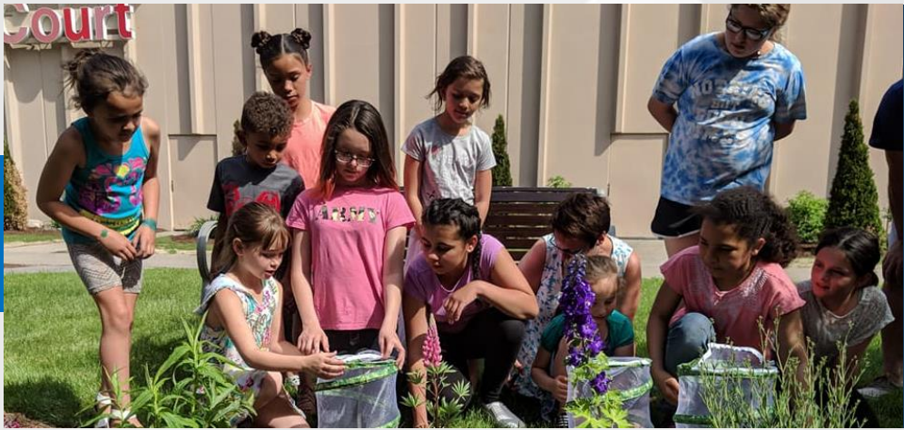
SPREADING THEIR WINGS

Our concept is currently being used in malls throughout Hawaii.